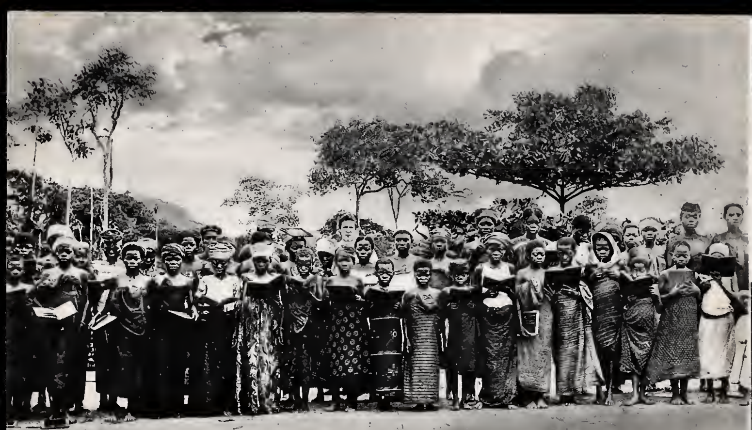
GIRLS' SCHOOL MALLEK MEMORIAL STATION, KAMERUN, WEST AFRICA. 13791.